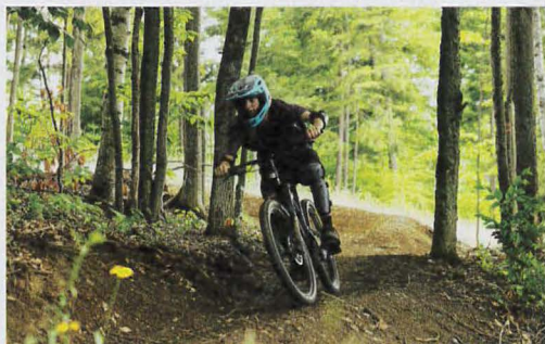
Left, the accommodations at Twin Farms and the new Suicide Six bike park; above, a Neapolitan-style pizza at Ransom Tavern.